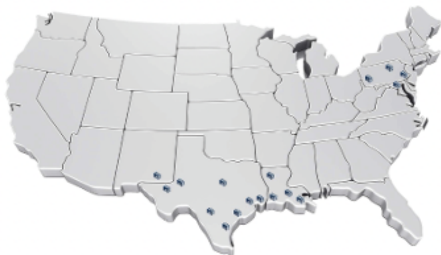
NTE Nationwide Locations